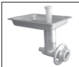
GRINDER ATTACHMENT 812HCPL Fits on Hobart Style #12 Drive Hubs