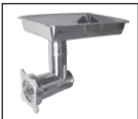
SS812HCPL Stainless Steel. Fits on Hobart Style #12 Drive Hubs