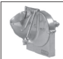
UVS-9DH / 9S Available with disc holder frame or adjustable S- Knife. Fits on Hobart Style #12 Drive Hubs

S-Knife, Disc Holder & S/S Grater/Shredder Discs (3/32", 3/16", 1/4", 5/16", 1/2")