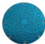
UVS-9000 GRATER DISC