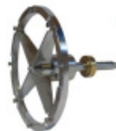
UVS-DH Disc Holder Frame